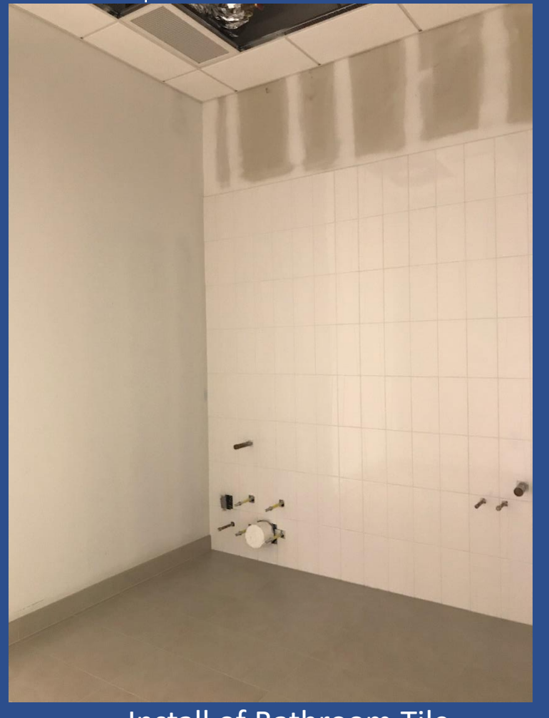
Install of Bathroom Tile