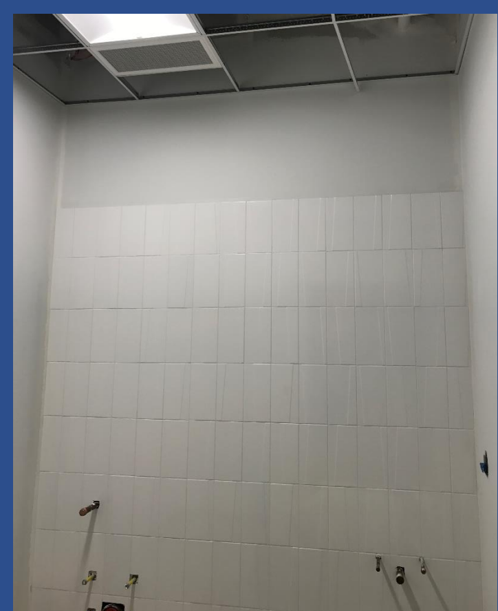
Install of Bathroom Wall Tile