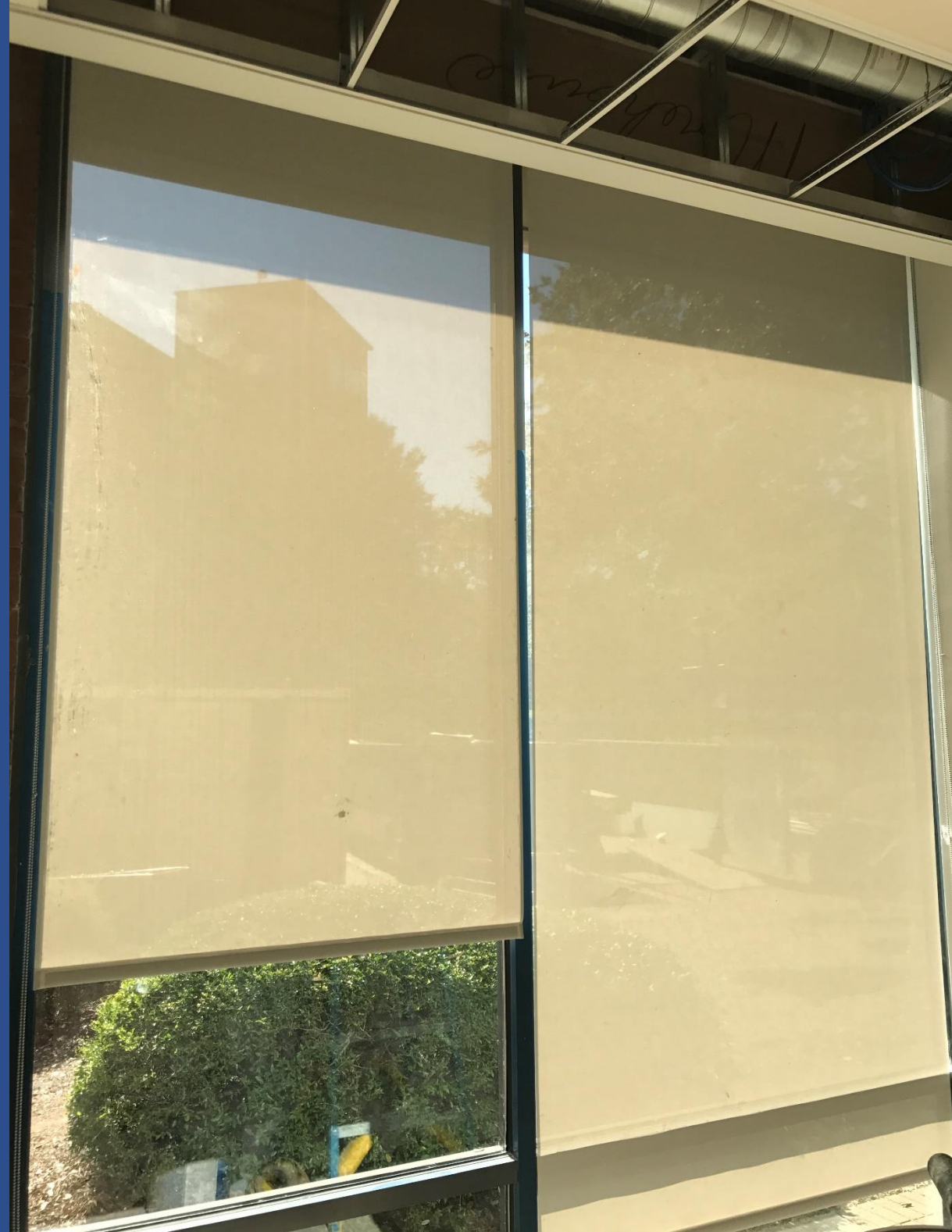
Window Shade Mock Up